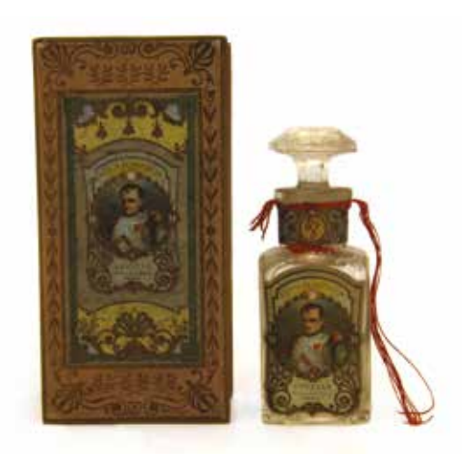
Étoile de Napoléon - Paris - Viville - 19th century

After a burgeoning trade in extravagant and elitist scents, the second half of the 20<sup>th</sup> century saw deep-rooted change: sales strategy in perfumery now targeted all social classes, resulting in sales prices being slashed, and costs decreasing as a result. Launch after launch followed suit, cashing in on this newfound popularity. Scent fashions and trends began rapid-cycling, stimulated by marketing and consumers hungry for new products. This thirst for newness had never felt as urgent. But for a handful of exceptions, perfumery shifted from the exceptional to the habitual, from an exclusive accessory to a mass-market product. Long neglected, scent became more popular than ever before, cropping up in food, household products, car air fresheners, offices and public spaces. And while a great many of these scents were designed to heighten pleasure, many were used to trigger desire and encourage buying.