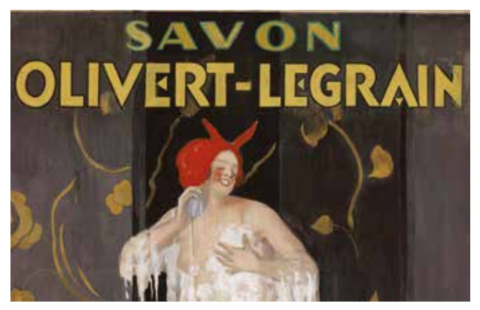
Olivert-Legrain soap poster - L. Capiello - 1920

And of course, perfume is the theme for many a private collection. But prior to the opening of the International Museum of Perfumery, no public establishment dedicated to safeguarding this heritage existed. Soap, make-up and cosmetics all fall under the remit of what we now consider to be perfumery, meaningluxuryalcohol-basedperfumery.