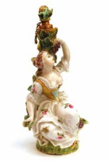
Figurine bottle in the shape of a young woman picking a bunch of grapes – Chelsea Porcelain - 18<sup>th</sup> century