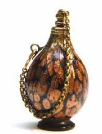
17th century Murano crystal bottle - Venice - silver-gilt base and stopper.

But the crusades and discovery of the New World ushered in a host of new raw materials. The powers of plants, spices and herbs were revered as proof of God's love in contrast to the stenches caused by the great epidemics of the times. In this golden age of mysticism and symbolism, plants were allocated therapeutic virtues based on their colours and shapes.