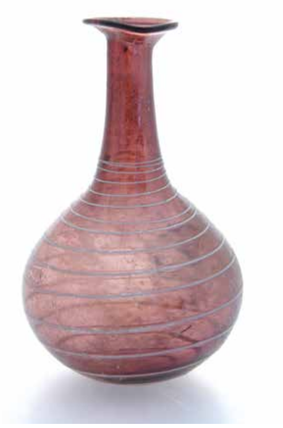
Piriform bottle - 2nd/3rd century BC - Syria - Blown glass

Under Julius Caesar, the body cult, with perfume serving as an essential accessory, reached its apex. In this polytheistic society, each divinity was even allocated their own fragrance. Rome may not have shown innovative flair in terms of creating new fragrances, but it popularised its use and revolutionised its transport and trade: lighter glass (blown or moulded) packaging was used for its air-tight qualities, dethroning earthenware as the go-to packaging.