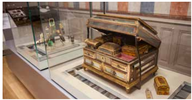
Grooming case – 18 th century - Venice, wood, glass, carton, cloth, metal International Museum of Perfumery, inv. 94 48

Grasse wanted to be the first to found an International Museum of Perfumery, and the town put forward a well-researched scientific proposal, backed by a tenacious desire to see the project come to light.