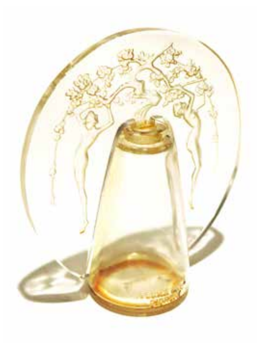
Leurs âmes - Paris - Lalique