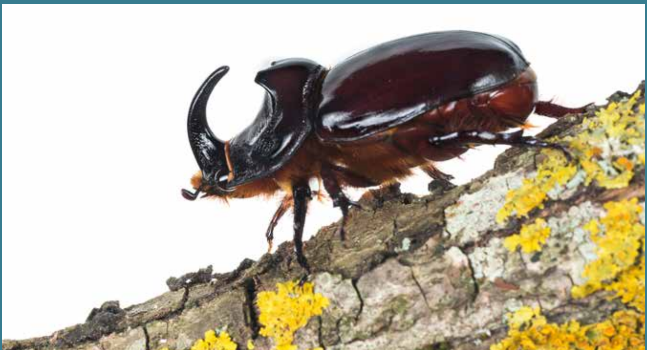
Rhinoceros beetle - P. Escoubas 2018