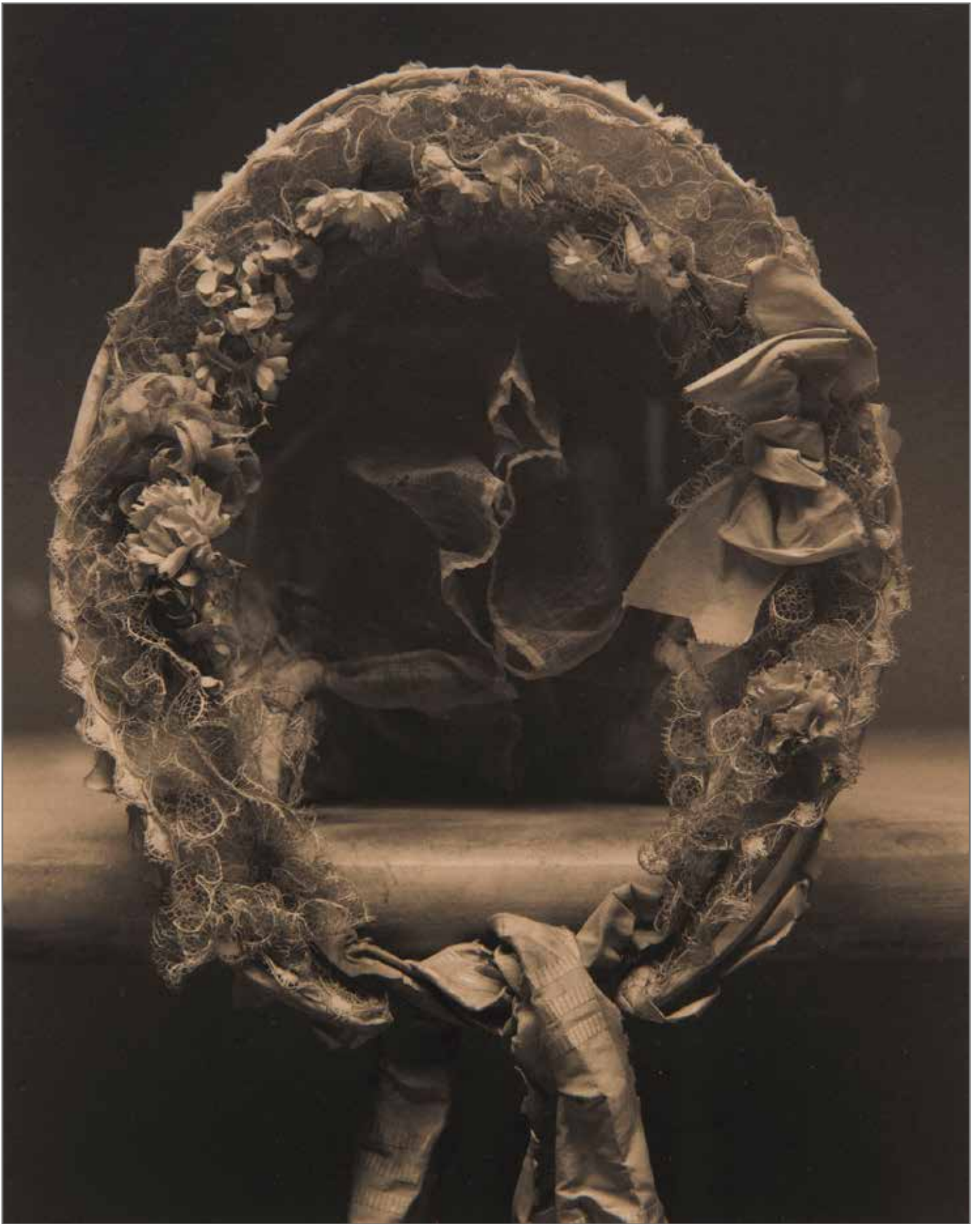
Head-dress from Museum of Art and History of Provence in Grasse, Michel Graniou, 2000s