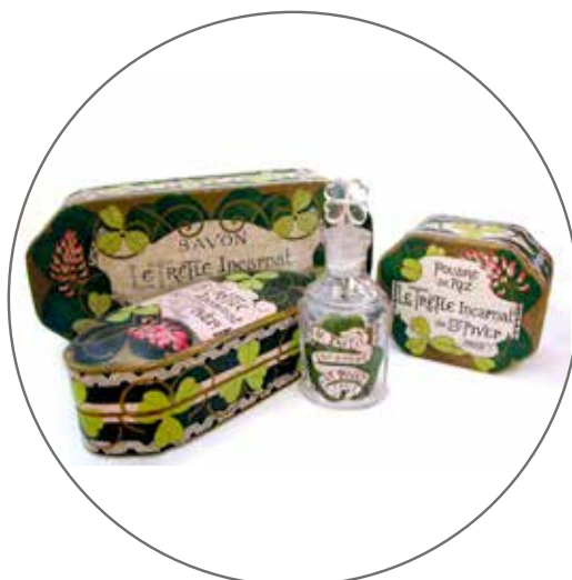
Bottle, powder box and soap box by Le Trèfle incarnat, L.T. Piver, 1899-1900, International Perfume Museum Grasse, Inv. 95 166, 95 18, 97 446