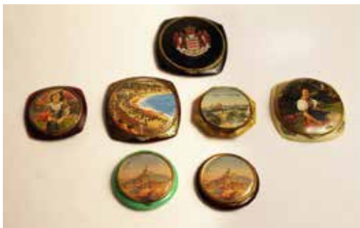
Powder cases Souvenirs from the Cote d'Azur, first half of the 20th century, ATD-Paris Collection