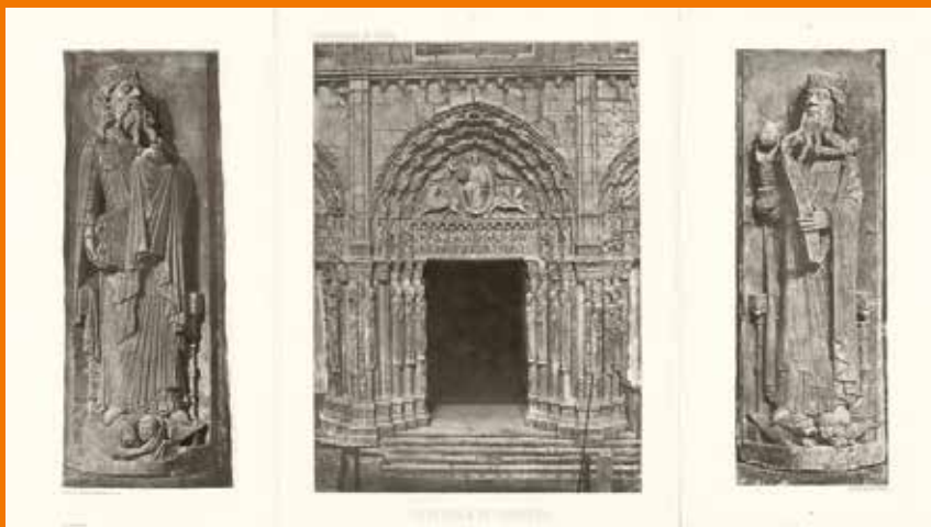
Chartres Cathedral, central entrance of the Royal doorway with plaster casts depicting two elderly men from the Apocalypse, Charles Nègre, Museum of Art and History of Provence, Grasse, Inv. 2002.32