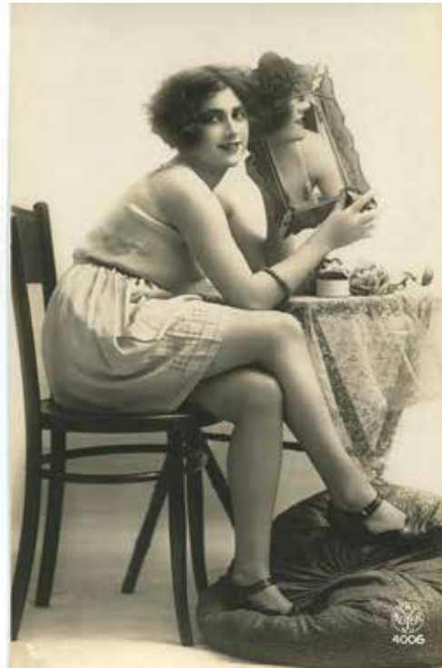
Postcards, circa 1910-1920