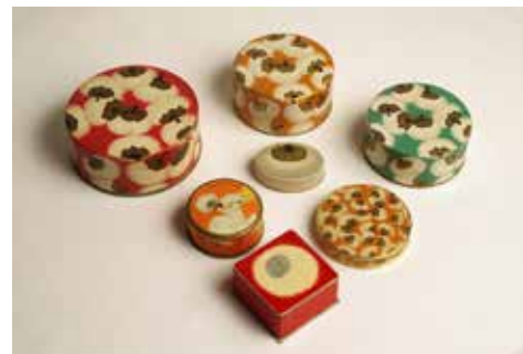
Coty powder boxes and powder cases, early 20th century, ATD-Paris Collection