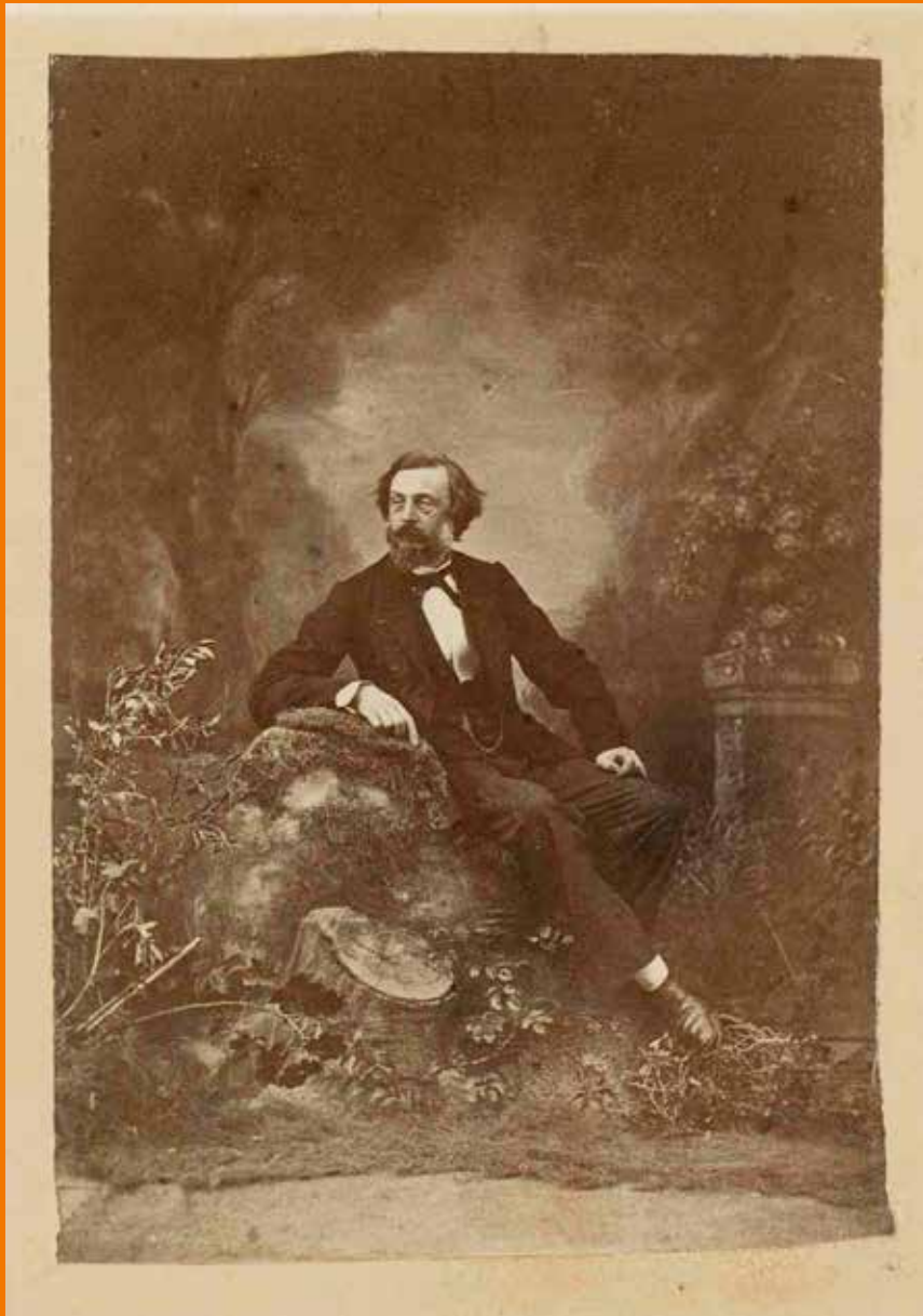
Self-portrait of Charles Nègre in his studio, circa 1875, Museum of Art and History of Provence, Grasse, Inv. 2002.67