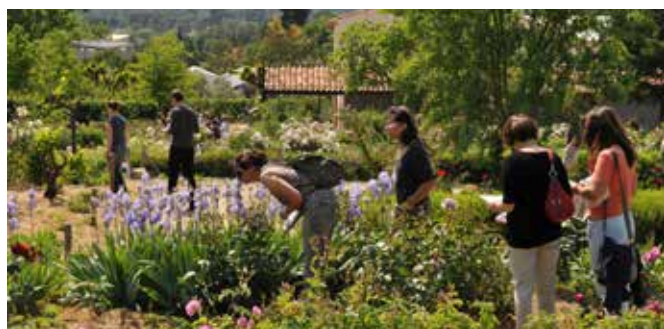
The Gardens of the MIP, Iris florentina in bloom

The “Bastide du Parfumeur” was brought into being with the aim of raising public awareness, at the most extensive scale, of the history of the growing of scented plants in the Pays de Grasse. This project, exclusively angled towards the various issues suffered by local agriculture, provided an essential place both to sustainability and the tangible and intangible heritage of the Pays de Grasse.