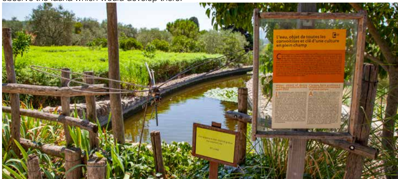
Water retention pond, the Gardens of the MIP

As part of the construction works on the Gardens, a pool was also established so that everyone could observe the fauna which would develop there.