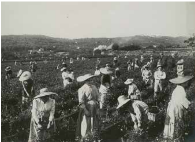
A jasmine harvest in the early 20th century, Grasse

Nowadays, these two countries supply in equal proportions 90% of world production.