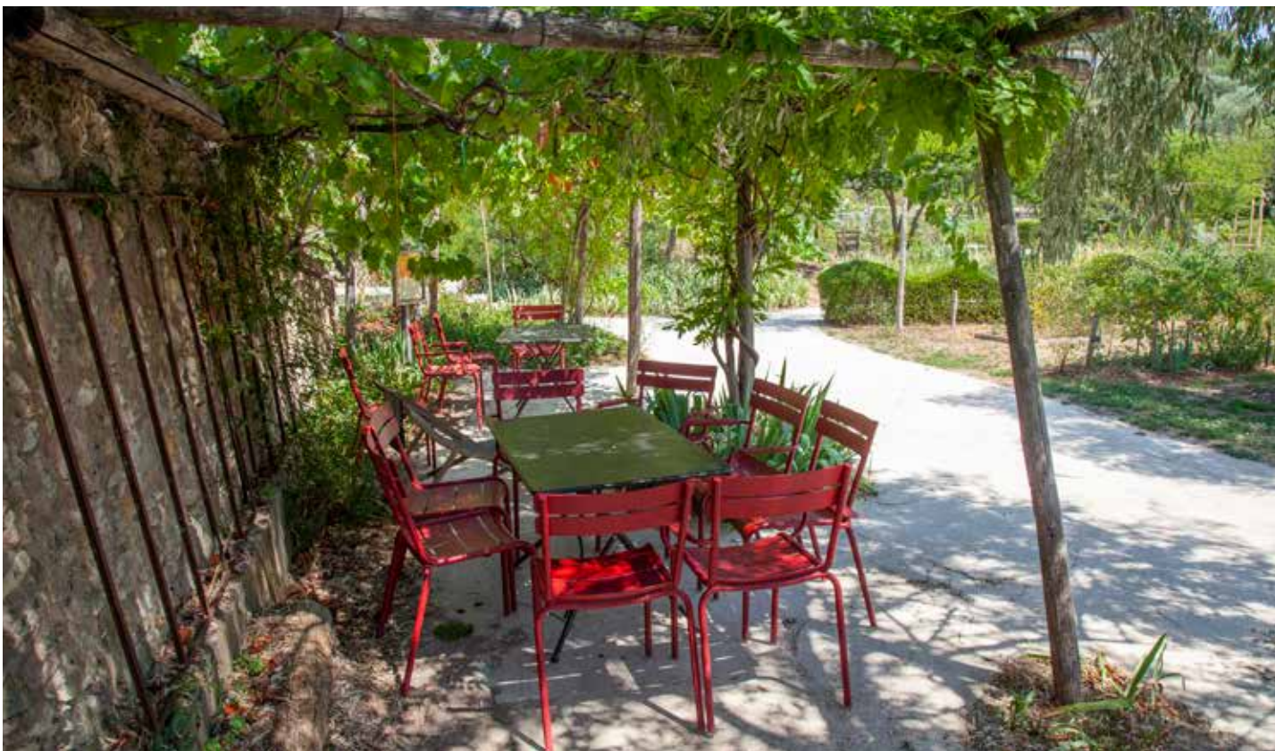
Pergola to the Gardens of the MIP

❖ The Pergola of the rosebushes: Made of metal and wickerwork, it references the harvesters' baskets.