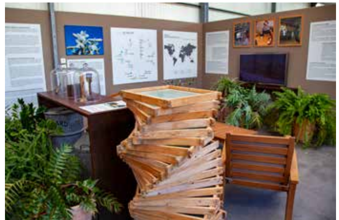
The greenhouse of the Gardens of the MIP

Gilles Sensini, the architect, commented: "The greenhouse forms a barrier which whets the visitor's curiosity. This allows us to stage the process of entering the gardens to make it like immersing oneself in an atmosphere conducive to a special experience. This barrier acts as a passage between the urban world and the landscape of the hills. Grafting a contemporary extension onto a traditional bastide is not simple, as the graft has to be accepted by the social body of the heritage it represents. The greenhouse recalls the agricultural culture of the region and engages easily with the local landscape".