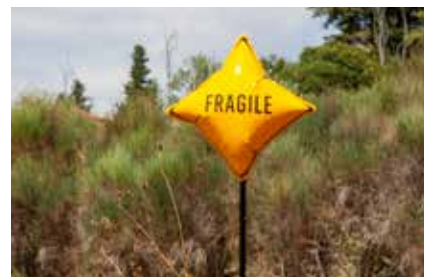
Free Figures, JMIP, 2019