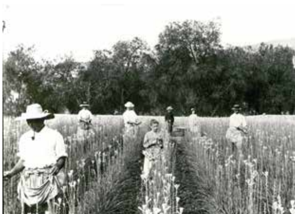
A tuberose harvest in the early 20th century, Grasse

For economic reasons related to wage costs and the globalisation of businesses, flower growing and the very presence of fields of scented flowers had almost disappeared from the Grasse area. It was, therefore, fundamental for the International Museum of Perfumery (MIP), through the Gardens of the MIP, to continue this tradition, registered in UNESCO's Cultural and Immaterial Heritage.