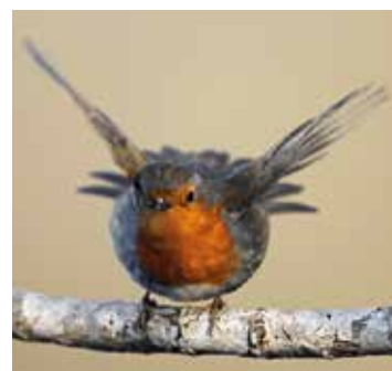
Robin

This is a commitment to use techniques which respect the environment, to practice organic gardening (no phytosanitary products – neither pesticides, nor synthetic fertilisers), to prune trees outside nesting season, to promote biodiversity by installing nest-boxes, hibernation shelters, making woodpiles, favouring native plants.